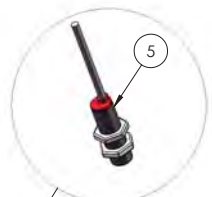
DETAIL A SCALE 1 : 2